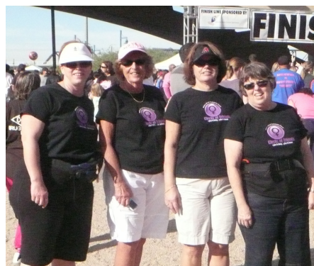
Making strides against breast cancer